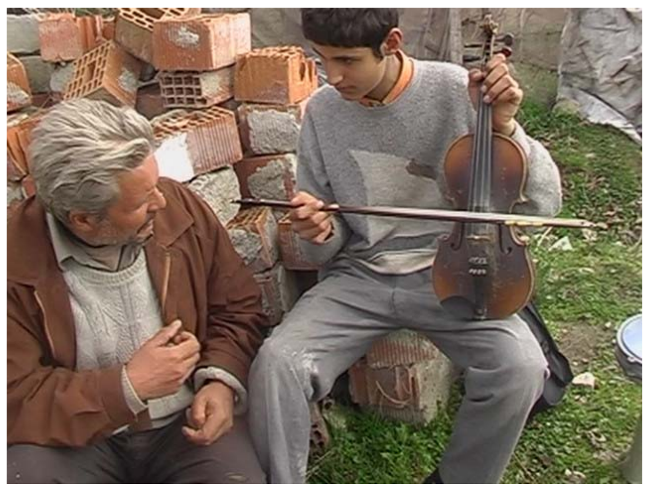
Fig. 2: Violin trainer and learner from Ovadüzü village.

retired school teacher. The last trainer is the only one who acquired his profession (teacher) through a formal educational process.