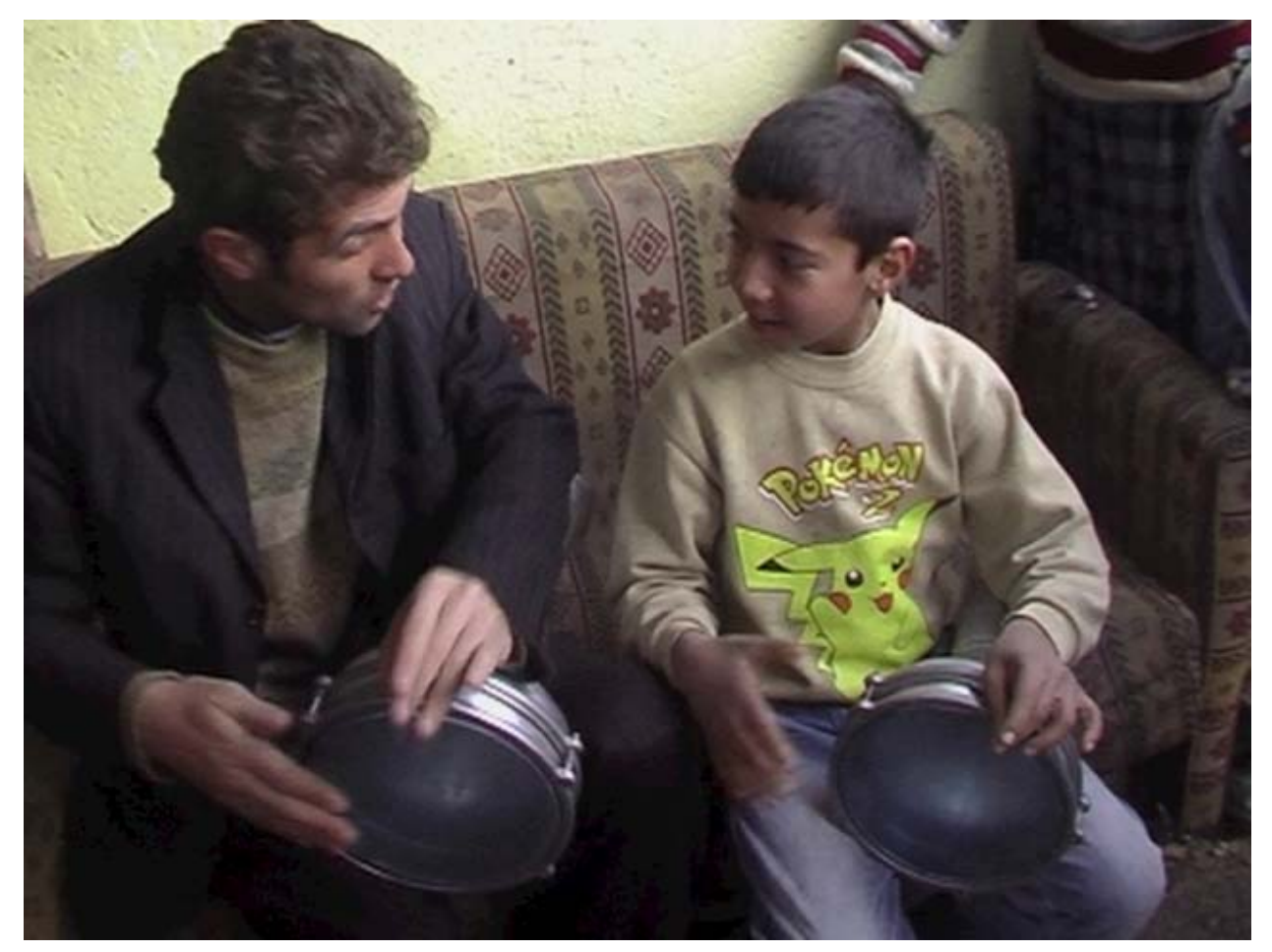
Fig. 3: Darbuka trainer and learner from Bahçeköy village.

Most of the 14 students chosen and observed as the sample group are males like the trainers themselves; only two learners are female. Both of the girls live in the city of Bolu itself and thus help to show the cultural difference between rural and urban settings. The age range of the sampled students is 7-18. Only two students are still of childhood age while the rest are in the stages of puberty, corresponding to ages 11-18. Almost all learners are at the primary education level and two are high school students. It has also been detected that, despite being of school age, one of the learners—due to socio-economic reasons—is not attending school.