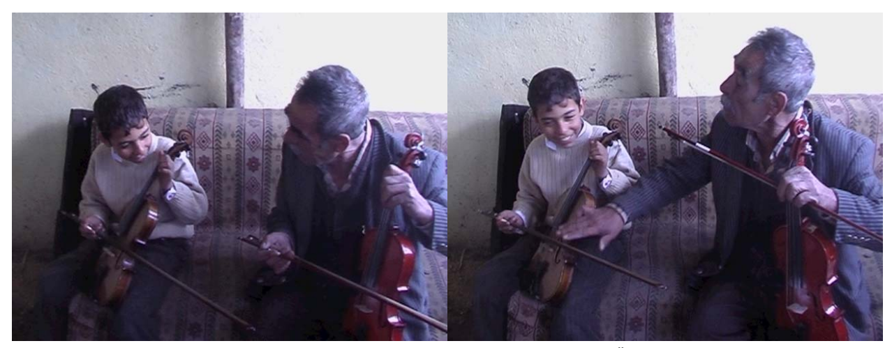
Fig. 4 and 5: Violin trainer and learner from Bahçeköy village.