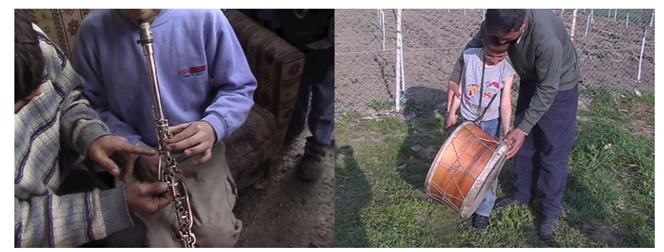
Fig. 7 and 8: Clarinet (Bahçeköy) and davul (Bolu) learners at the beginning stage.

In Bolu, instrument teaching within the context of oral tradition is, parallel to the formal educational instrument-teaching processes, conducted through personal lessons with teacherstudent interaction at the core. In some cases a third person playing an accompanying instrument is integrated, yet this practice is so uncommon that it has no measurable effect on general tendencies.