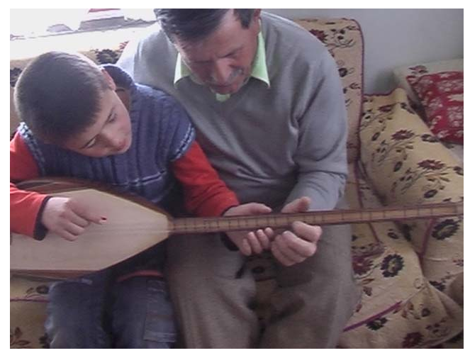
Fig. 6: Bağlama trainer and learner from Demirciler village.

The violin comes first among the instruments that are taught. One noteworthy point in the playing and teaching of the violin is that, as opposed to common practice, it is not played by leaning the instrument on the neck. Instead, masters and apprentices play the violin by placing it on their knees like a Byzantine lyra or kemane ("kamancheh") while sitting (see Figures 2 and 4). When standing, they hold the violin as they would a Karadeniz kemençesi ("kemenche of the eastern Black Sea Region in Turkey") without leaning or placing the instrument over the body.